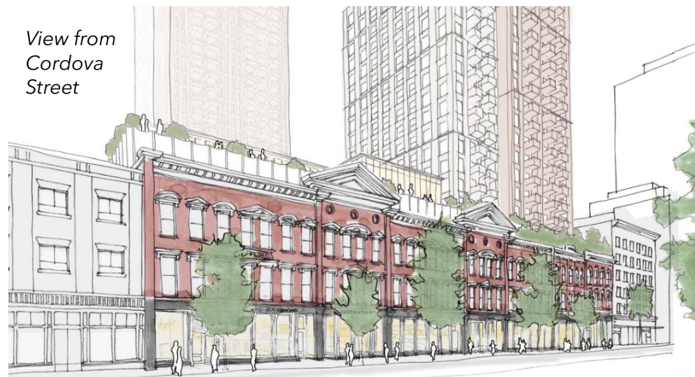
View from Cordova Street