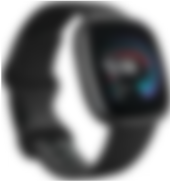
Fitbit Versa 4 Fitness Smart Watch