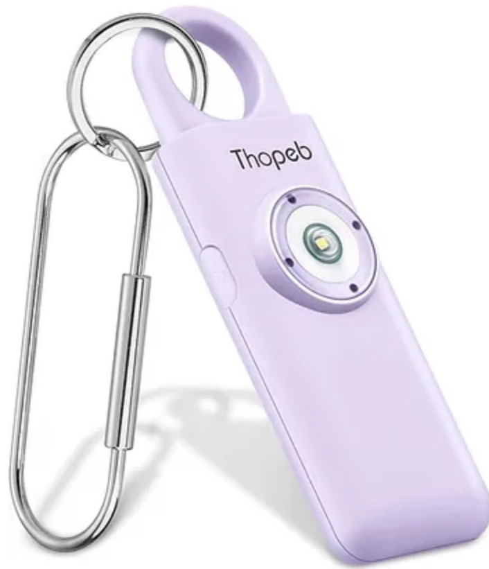
Thopeb Siren Keychain