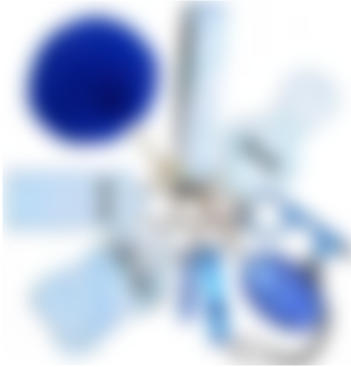
10 Piece Self-Defense Keychain